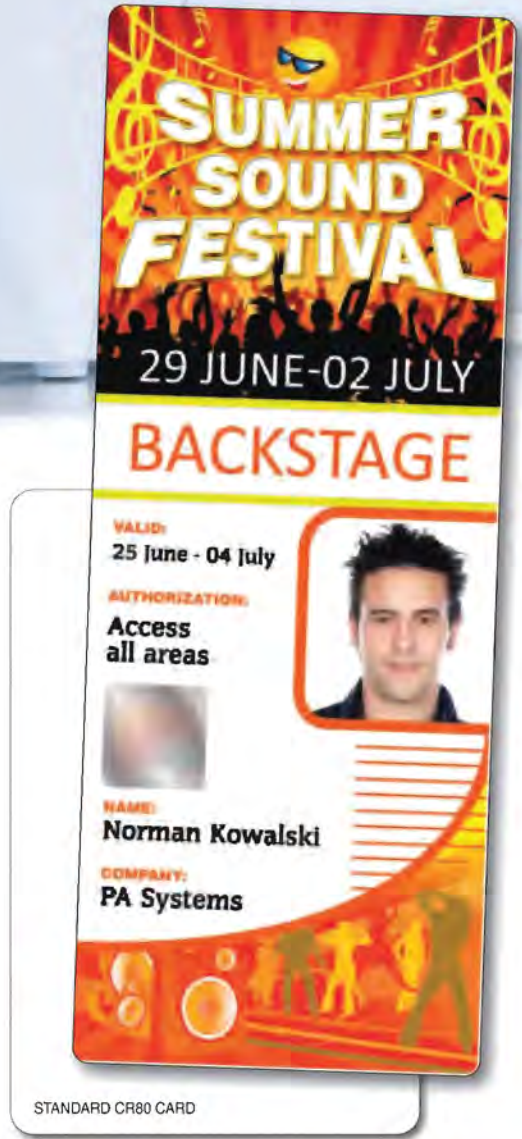
STANDARD CR80 CARD

Magicard's patented HoloKote ® security technology adds a watermark to the card as it is printed - it requires no additional consumables and can be customized to an individual logo design - enabling true security at no extra cost.